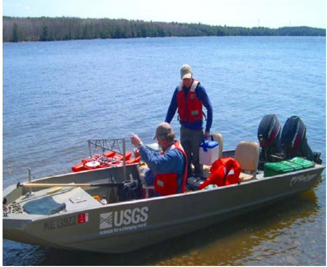
US Geologic Survey staff using acoustic doppler current profiling to measure tidal flow levels.

This year's ground-truthing efforts are animated on our web site. Of special note in the upper Kennebec animation is the dramatic