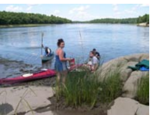
Burnt Jacket Channel in the Kennebec