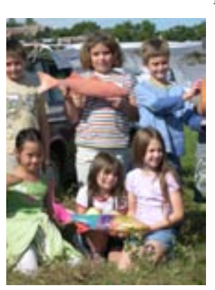
Happy fish printers

Since I participated in my first Bay Day this past spring, I have come to appreciate that Bay Day is a rite of passage for students of the local grade schools and is a memory that these fourth graders take with them for the rest of their lives. During my school visits, the "older" kids speak vividly and excitedly about the day they went to that "classroom" that is the Bay itself and the younger students look forward to their turn.