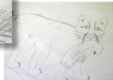
Bobcat & Bluejay