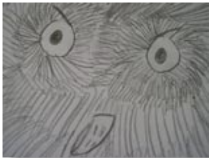
FOMB keeping an eye on the Bay