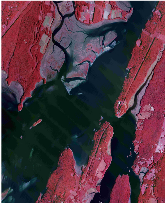
2009 Sewall color infra-red photograph of Merrymeeting Bay. Part of FOMB's 10-y ear update of aerial vegetation and land use study

In 2008 we rehired the James W. Sewall Company to perform a 10-year update of our 1998 study which examined changes in both aquatic vegetation and land use in and around the Bay between 1956 and 1998. The study used aerial photography and geographic information systems [GIS] to document and compare these two items from