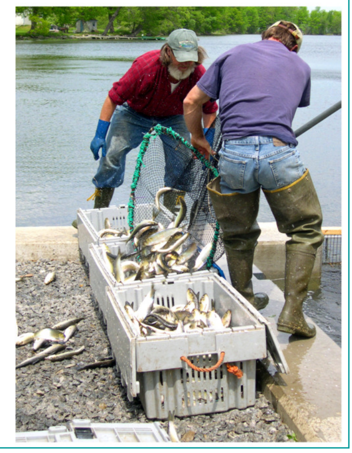
Webber Pond Alewife Harvest

With between 650 and 900 dams in Maine we have clogged the arteries feeding into the Gulf of Maine and beyond.