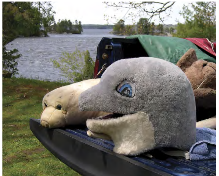
Beach Seining and Marine Mammals