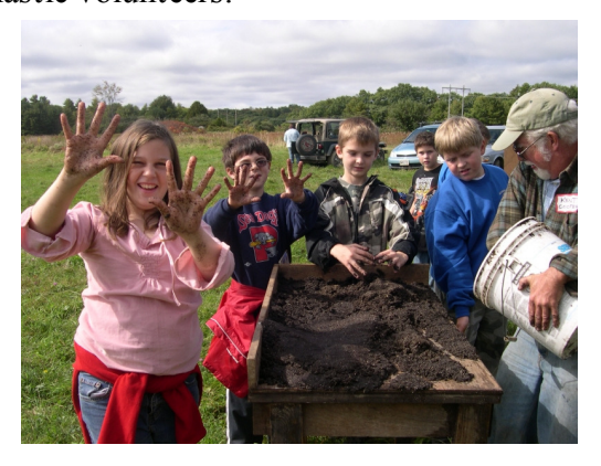
Watershed modeling. If only the rest of school was this much fun!

September 30<sup>th</sup> marked another successful Fall Bay Day for FOMB. Twice a year FOMB turns the Bay into a classroom for area fourth graders. FOMB believes the best way for children to learn about the environment is to touch, smell, see, and even taste the environment around them. Bay Day is inspiring and vital to our children but it would not be possible without our enthusiastic volunteers.