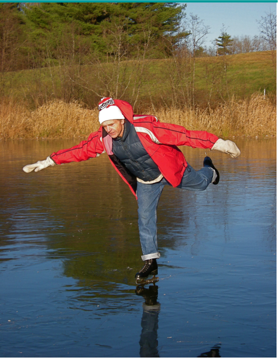
An exuberant new easement donor enjoys first ice.

Then, beginning in the early 1980s, home building began in earnest. Farming ceased in the immediate area. By the early 1990s, cars occasionally pulled into our driveway. "Wanna sell that field over there?" more than one driver would ask. "How about that corner lot?" They were predictable questions, since roughly half our property is roadside frontage. Of course we declined.