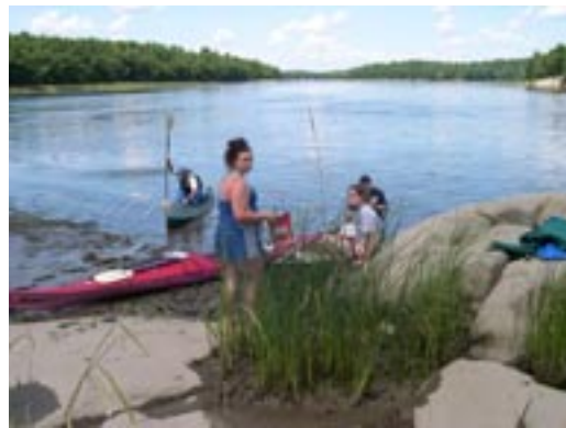
Burnt Jacket Channel in the Kennebec