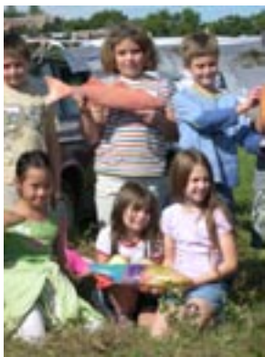
Happy fish printers

Since I participated in my first Bay Day this past spring, I have come to appreciate that Bay Day is a rite of passage for students of the local grade schools and is a memory that these fourth graders take with them for the rest of their lives. During my school visits, the "older" kids speak vividly and excitedly about the day they went to that "classroom" that is the Bay itself and the younger students look forward to their turn.